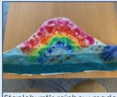
Staplehurst's rainbow made with pupil's handprints