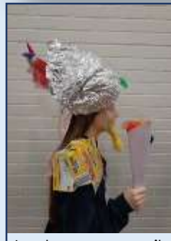
Leybourne pupils made hats out of recycling