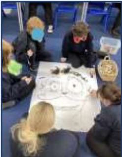
Canterbury's self portrait