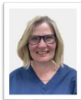
S Eade Reintegration HLTA